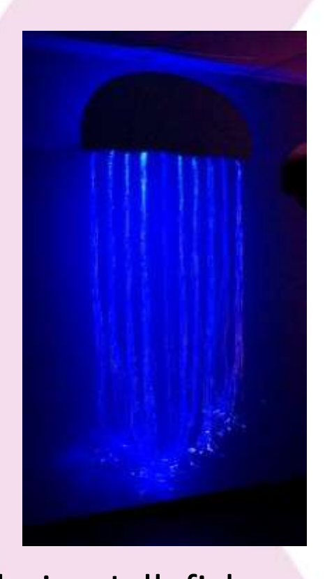
Calming Jellyfish 030040 Product Manual